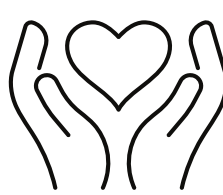
And Much More!